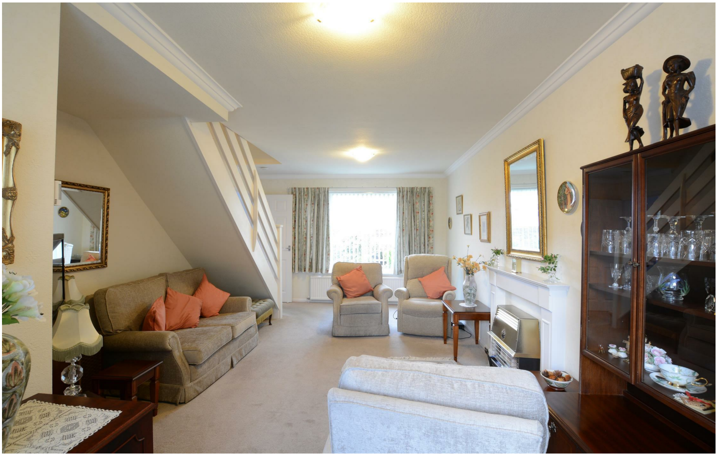
A PARTICULARLY DECEPTIVE, THREE BEDROOM MID TOWN HOUSE.

Situated in a small courtyard style development of similar houses, within this highly regarded residential suburb, great for families and commuters alike.